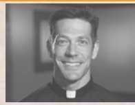
Fr. Mike Schmitz