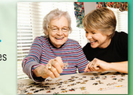
As featured in the Catholic Herald